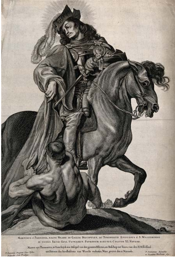
Fig. 9: Cornelis Visscher after Pieter Soutman and Anthony van Dyck, St. Martin and the beggar. 1650. Etching, 44 × 31,2 cm.