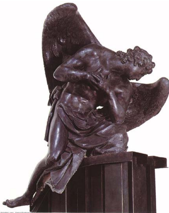
Fig. 4: Georg Raphael Donner, Adoring angel. 1734–1735. Alloy of lead and tin, 200 cm. Hungarian National Gallery, Budapest.

St. Martin was born in 316 or 317 in Roman Sabaria (now the city of Szombathely, Hungary) as the son of a Roman tribune. 19 Martin learnt about Christianity at the age of ten, subsequently became a catechumen in the city of Pavia. On his father’s insistence, he took the military oath at the age of fifteen, beginning active military service at the age of seventeen. While he was serving in Amiens in Northern France, he performed his most famous act of mercy—sharing his cloak with a beggar. One day, as Martin was returning to the city during a severe winter frost, he saw a beggar lying naked at the gate. None of the passers-by took notice of him. To prevent the beggar from freezing to death, Martin decided to give him half of his cloak, because he had already donated all the money. He cut the cloak with his sword and covered himself with the remaining half. Some of the passers-by started laughing, others were ashamed that they had not helped the beggar. The next day St. Martin had a dream in which Jesus Christ appeared to him in the half of the cloak given to the beggar, saying to the angels, “Here Martin, though still a catechumen, has clothed me with his cloak.” Christ then declared that it was he who was dressed in the cloak in the person of the beggar. Soon thereafter, Martin left the army, was baptized, and became a disciple of Hilary of Poitiers, who ordained him an acolyte. In