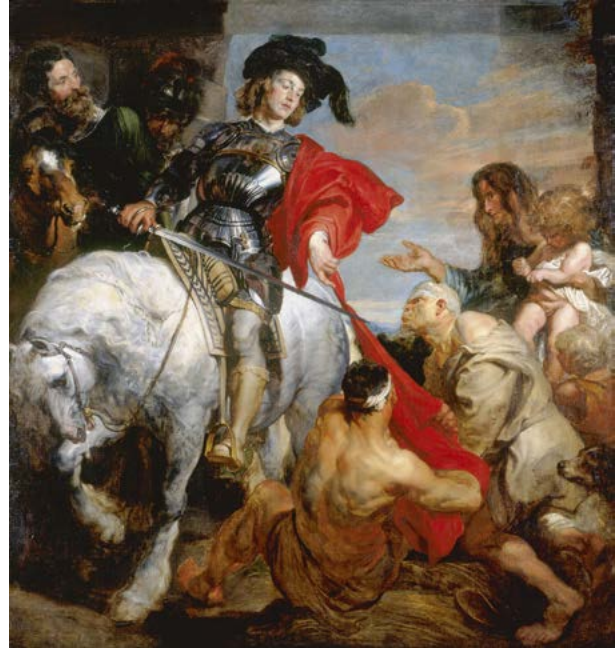
Fig. 7: Anthony van Dyck, St. Martin dividing his cloak. 1619–1620. Oil on canvas, 182,9 × 172,7 cm. Windsor Castle, Windsor.

Castle. These paintings, very similar in type, were made under the influence of van Dyck's training with Peter Paul Rubens. Van Dyck took the composition of St. Martin and the beggar from his oil sketch. In both paintings, except for St. Martin and the beggar, there are also Martin's servant and the guard at the gate. Instead of one beggar, there are two beggars in the Zaventem version and even