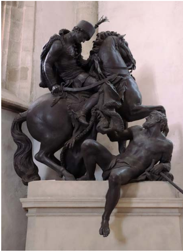
Fig. 1: Georg Raphael Donner, Sculptural group of St. Martin and the beggar. 1734–1735. Alloy of lead and tin, 275 cm. St Martin's Cathedral, Bratislava.