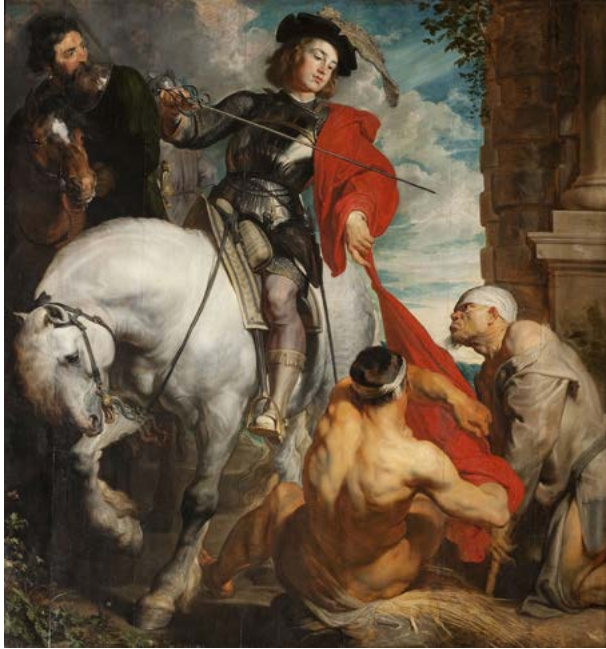
Fig. 6: Anthony van Dyck, St. Martin dividing his cloak. About 1618. Oil on panel, 171,6 × 158 cm. Saint Martin's Church in Zaventem, Belgium.