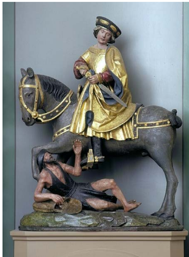
Fig. 5: Unknown author, St. Martin gives part of his cloak to a beggar. 1515–1525. Wood, 95 cm. Parish Church of St. Martin in Breitenbrunn, Germany.

I would like to draw attention to an iconographic type that seems to be a model for Georg Raphael Donner. As far as the probable models are concerned, we will always speak of probability, since the contracts for the creation of the altar have not