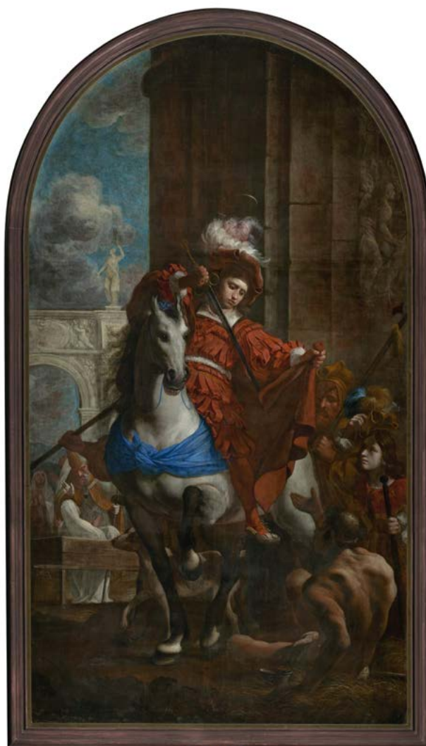
Fig. 8: Karel Škréta, St. Martin sharing his cloak with a beggar . After 1650. Oil on canvas, 324 × 186 cm. National Gallery Prague.

arguments seem unlikely. MOJZER 1992 b (see in note 5), p. 469; HAĽKO – KOMORNÝ 2010 (see in note 7), p. 354.