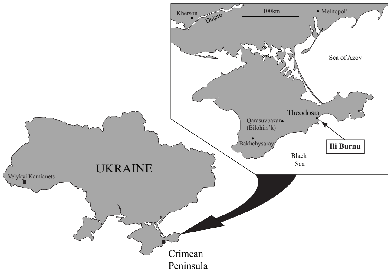
Fig. 1. Locality map of sites mentioned in the text.

In 2018, our team published an account of the uppermost Jurassic to lowest Cretaceous rocks of eastern Crimea – that crop out in the cliffs at the eastern extremity of the hill mass of Tepe Oba, around the headland of Ili Burnu. That publication was then commented upon by Arkadiev et al. (2019). We are at something of disadvantage in discussing local lithostratigraphy in reply, because whereas we have tried to present carefully measured representations of the accessible stratigraphic sections at Theodosia (Bakhmutov et al. 2018, figs. 2 and 3), Arkadiev et al. (e.g. 2019, fig. 2; and earlier papers by the same authors, cited herein) promote synthetic and composite diagrams. It is not possible to compare measured logs of tangible rock sequences, an accurate lithostratigraphy, with stylised diagrams and estimated thicknesses. Earlier, Bakhmutov et al. (2018) referred to problems encountered when trying to make comparisons with published Russian accounts, where it was apparent that the thicknesses given were less than accurate.