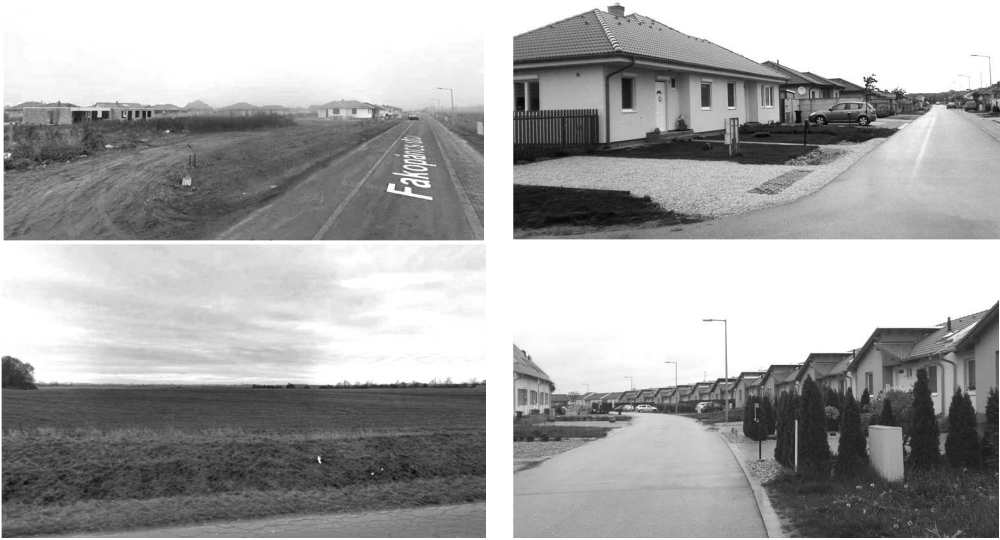
Fig. 4. Fakopáncs Street and Pisztráng Street in December 2011(left ) and April 2017 (right)