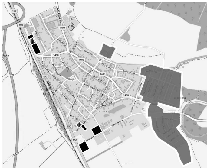
Fig. 1. Rajka, with the new quarters (grey with white contour), housing estates (with stripes) and new housing estates (black)

hely) – bringing with them the possibility of reorganization within the urban agglomeration. Rajka was “promoted” as Bratislava’s potential suburb and gained instant advantage over the already saturated suburban villages. Property prices were much lower than those of its Slovak “fellows”, and it was also much less saturated.