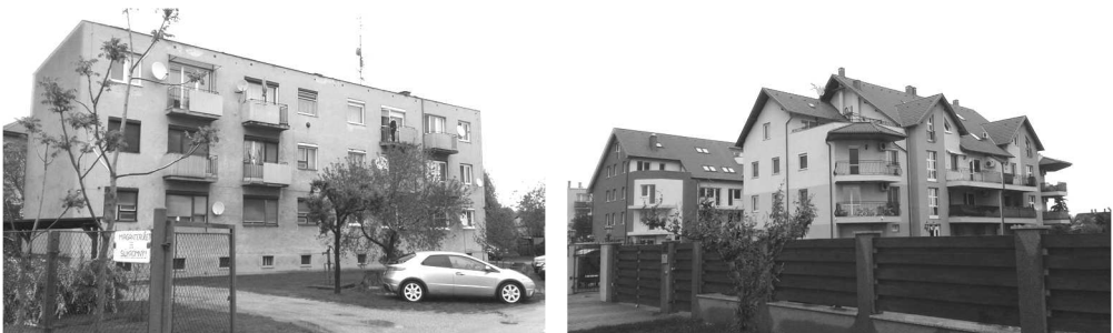
Fig. 6. Old and new housing estates