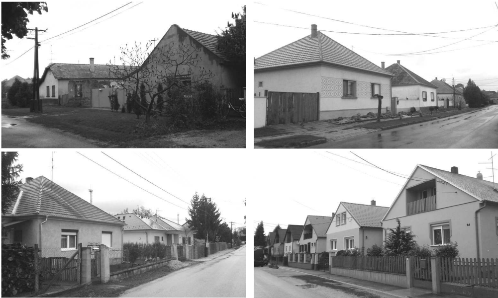
Fig. 5. Types of street views in Rajka: old building in bad condition (left above); partly renewed buildings (right above), partly renewed and totally renewed building with newcomers (left below), renewed buildings with newcomers (right below)