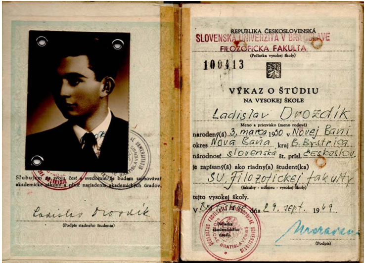
Gažáková, Fig. 1. Ladislav Drozdík's Student Grade Book, title page.