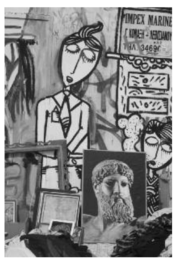
Fragments and Ruins of Ancient Heritage.

a temporary state of unrest, a momentary schism in normativity, leading to the light at the end of the tunnel. Yet, when it is clear that the crisis being faced by Greece and Europe is not only economic, nor one with a simple fiscal solution, then the idea that a society can return to normal is both empirically intangible and intellectually fraught (Tsilimpounidi, 2017). It is rather difficult to expand upon the ways 'crisis' has altered the fabric of Greek day-to-day life as the situation unfolds rapidly, rendering any attempt to theorise contingent at best, and at worst, always already out of date. This kind of 'crisis' is more suited to media analysis, with its rapid pace of dissemination. And yet, there are nevertheless some emerging paradigms like Cavafy's evocation of 'Waiting for the Barbarians' which addresses the loss of certainty that remains when 'crisis' exposes the constructs of nation and Others to be slippery. In other words, there will always be lulled citizens