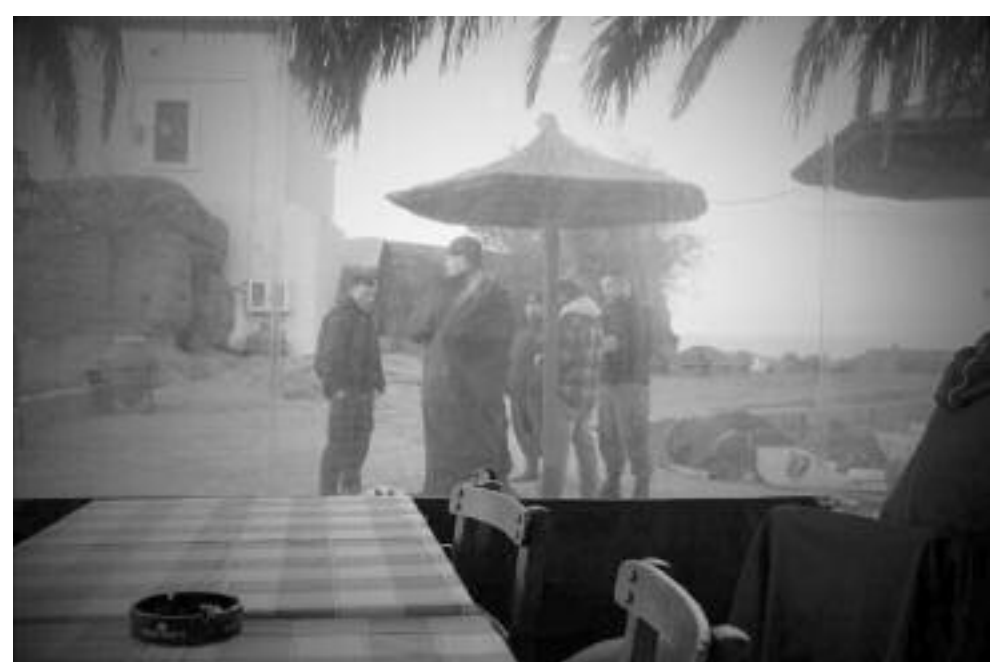
Refugee crisis management with view of Greek taverna.

resettlement promises made in 2015, effectively "trapping" refugees in Greece (AI, 2016). Moreover, repayment of the "Greek" debt is forecast to continue until 2057. In other words, the production of Greece as Europe's hotspot, as its holding container, coincides with the production of Greece as Europe's debt colony, as its economic and symbolic periphery (even as it is posited as the 'cradle' of its civilisational or political values). Transformed, through the supranational management of 'nesting crises', into the "debtor" and the "camp" of Europe, Greece becomes a "waiting room of history" (Chakrabarty, 2000: 7; Tsilimpounidi, 2017: 87-88; Carastathis, 2017).