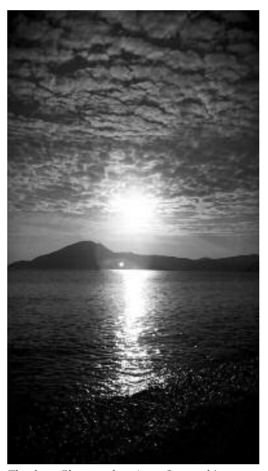
The shore.

Imagine you are standing on the shore of a sea staring across at a landmass opposite, which forms your horizon. You know, although they are not visible to you, that beneath the surface of this sea are the corpses of thousands of people who tried to cross it in order to arrive where you are now standing. Your horizon, then, is a border. This sea has long been viewed as a threshold, and yours is not the first epoch during which it has been crossed by masses of people in a rising tide of desperation, propelled by unspeakable violence. But crossing it has, in your epoch, become a crime. It is the liquid border between what is called "Greece" and what is called "Turkey": and the solid ground on which you are standing is the "entrance gate to Europe." That you are standing here at all depends on prior crossings-including those of your grandparents—which, many years later, contributed to this threshold nation the semblance of solidity. even as they kept gazing across to a place they never ceased to remember as "home." Recently, this border has been multiplied; metaphorically and discursively, it travels; it exists in the imagination as far away as that "island nation" eager to "Brexit" from