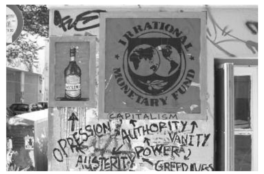
Stencil 'IMF', artist: Bleeps.

spending capacity of ordinary people was reduced by 40%, leaving one third of the population below the poverty threshold (Traynor, 2013). In the absence of systematic studies, it was estimated in 2011 by NGOs that 20,000 people were rendered homeless in Athens alone, a number that has visibly grown (and includes recently arrived refugees) in the intervening six years (Klimaka, 2011). The health system has been radically defunded, leading to devastating direct and indirect consequences including increases in infant and adult mortality rates, seropositivity rates resulting from new infections, suicides, and malnutrition (Kentikelenis et al., 2014). Just in 2012, we saw a 45% increase in the use of antidepressants; suicide rates doubled in 2011 and tripled in the first months of 2012 (Mason, 2012). The effects of austerity were sharp and immediate: as early as 2011, Doctors of the World declared a state of emergency in the centre of Athens, redeploying its international units to the city centre (Kanakis, 2011).