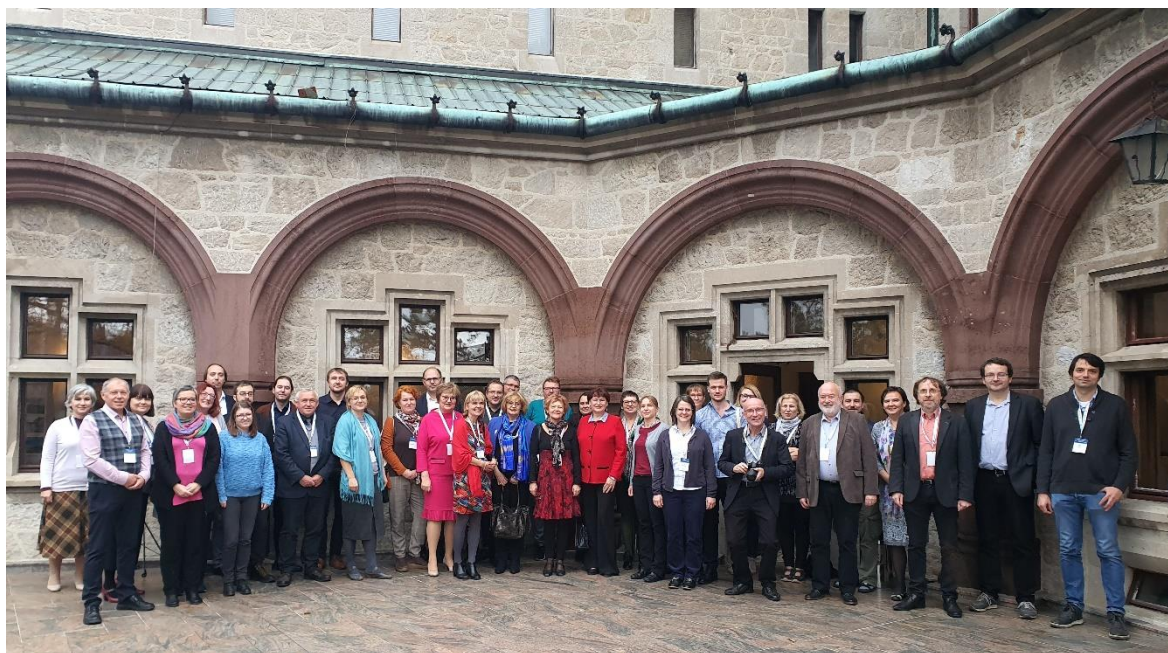
Participants of the Colours of Freedom - 9th Slovak and Czech Sociological Days conference

Decolonising Global Education , Bratislava, 20 participants, 10 September 2021, hosting institution: Institute for Sociology of the Slovak Academy of Sciences in Cooperation with COST Network (Decolonising Development).