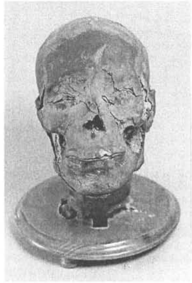
Fig. 4: Contemporary state of the head of the mummy.

Number C9 includes 2 mummies of small crocodiles. One of them is still wrapped, another one is without wrappings. A gift from Earl Zichy.